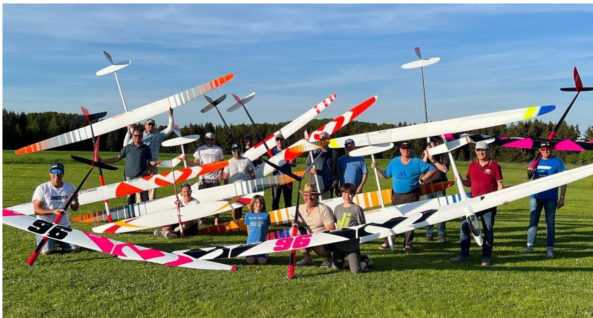
Sportclass competition in Bitz (GER) – May 2022

Sadly two of the scheduled CONTEST-Eurotour events needed to be cancelled, so that in the Sportsclass (besides that amazing world masters) there were only two competitions countable in this years` tour.