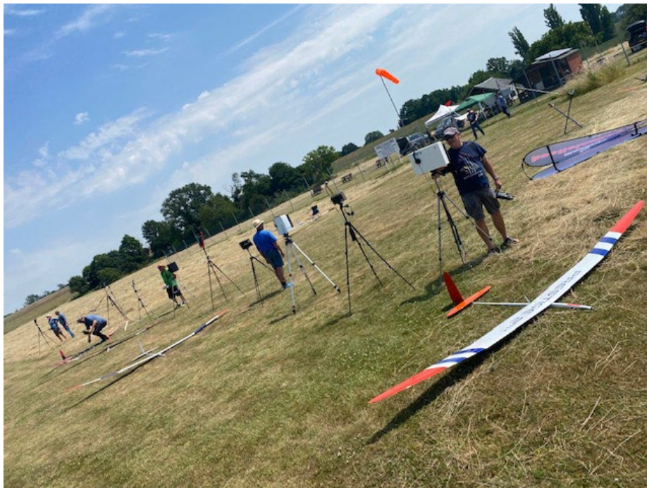
Hot summer 2022 in Riesa/Canitz. An amazing flying site for GPS-Triangle soaring.

At the end of the season it is great to see that there were 2-days-competitions as well as 1-day-competitions and both were attractive out of various reasons. To compensate for bad weather a 2-days-event certainly has advantages as for many taking one day off on a weekend is easier to manage than being off for the whole weekend.