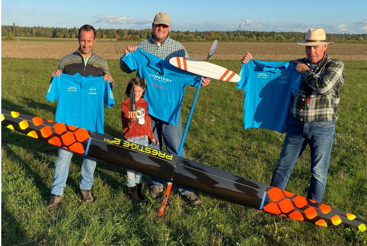
Winners of the CONTEST-Eurotour GPS-Triangle Lightclass 2022