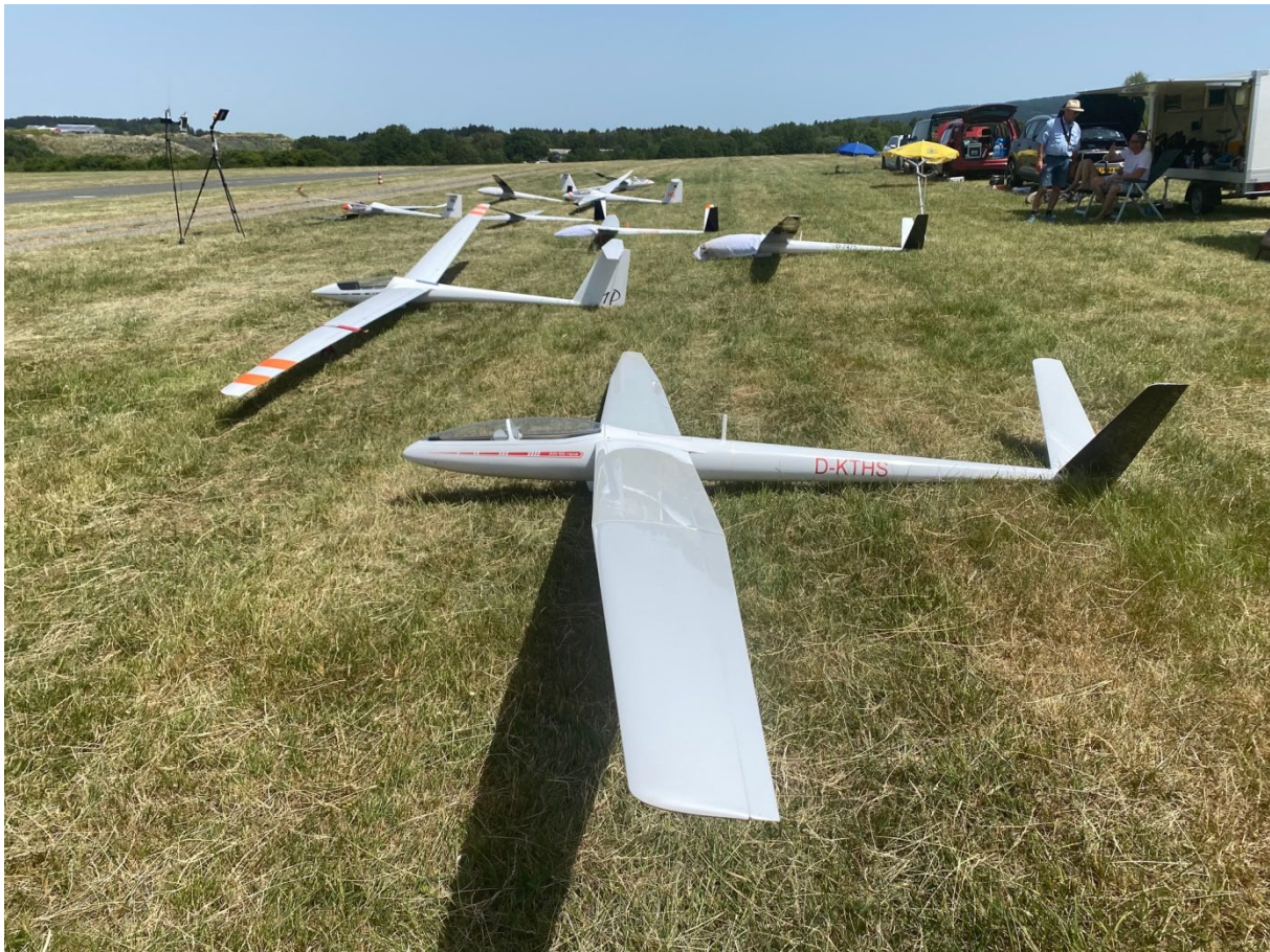
Scenes from the Scaleclass German Championship in Münchberg/Zell

In Scaleclass there were 6 competitions flown in total, 3 of them with the “1:3” rule set and 3 with the “SLS” rule set. It is obvious, that the Scaleclass is the “Classic-GPS-Triangle-Class” and meanwhile perfectly established. The numbers of competitors is stable in the range of 20 per competition which makes the airfields quite busy already, but allows the pilots to get lots of airtime during the competitions. It is quite uplifting to see, that there are also newcomers to this, very specialized Class. So at the end of the season there were quite a few new names visible on the score sheets. For example Honza Rudolf from Czech Republic, Thomas Leitgeb from Austria who started flying Sportsclass last year bringing his own built Quintus to fly Scaleclass 2022. But also names like Falk Waidelich, who builds his own LS6 in foam-obechi-technique, could compete astonishingly well similar to Florian Griese from Berlin who brought along a homebuilt ASH-31! Furthermore there was some “cross flow” from other classes detectable. Jure Marc from Slovenia who is regularly flying F3F joined two Scaleclass competitions and Michael Kreß (GER), who won several big F3J and F5J competitions is now joining the Scaleclass circle and placing extremely well. Finally he managed to take 7 th place in the overall CONTEST-Eurotour results for 2022. Congratulations.